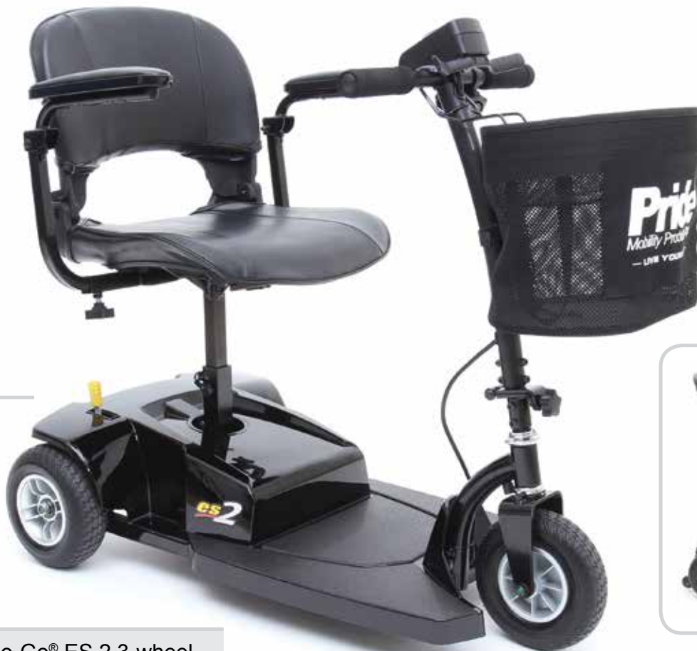
Go-Go ® ES 2 3-wheel

The Go-Go ® ES 2 from Pride ® brings exceptional value and easy transportation together in a compact, lightweight package. The stylish Go-Go ® ES 2 has a weight capacity of 250 lbs. and a convenient canvas basket located on the tiller.