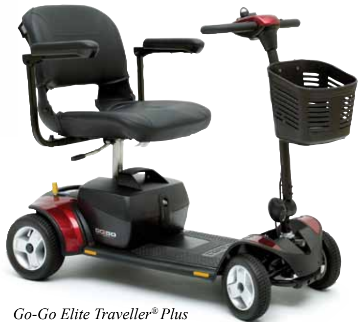
Go-Go Elite Traveller® Plus 4-wheel

The Go-Go Elite Traveller® Plus was designed to bring travel scooters to a greater range of people than ever before. An increase in length and width and a weight capacity of 325 lbs. combine with a wraparound delta tiller to allow both the larger individual and those with limited dexterity to experience the benefits of a travel specific mobility product for the first time. One hand feather-touch disassembly makes the Go-Go Elite Traveller Plus the easiest travel scooter to take along anywhere.