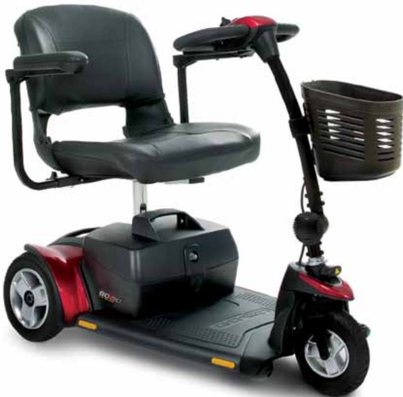
Go-Go Elite Traveller® Plus 3-wheel

The Go-Go Elite Traveller® Plus was designed to bring travel scooters to a greater range of people than ever before. An increase in length and width and a weight capacity of 325 lbs. combine with a wraparound delta tiller to allow both the larger individual and those with limited dexterity to experience the benefits of a travel specific mobility product for the first time. One hand feather-touch disassembly makes the Go-Go Elite Traveller Plus the easiest travel scooter to take along anywhere.